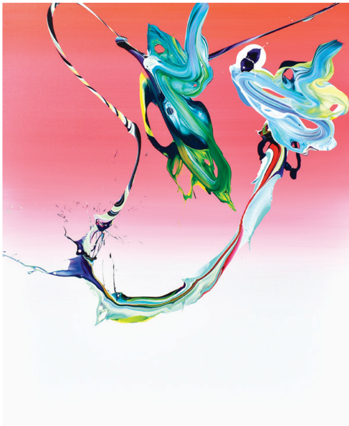
Alex Voinea av_674 , 2020, Acrylic on linen, 159 x 130 cm.