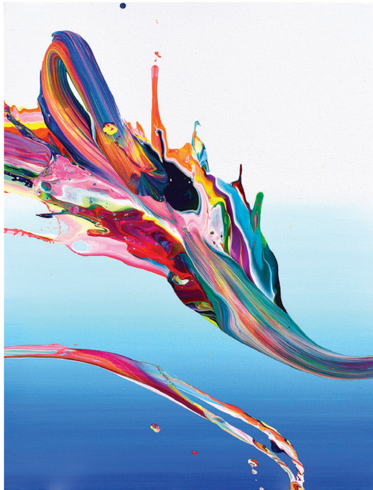
Alex Voinea av_584.1&2 (diptych) Acrylic on linen 130 x 97 cm each. 2019