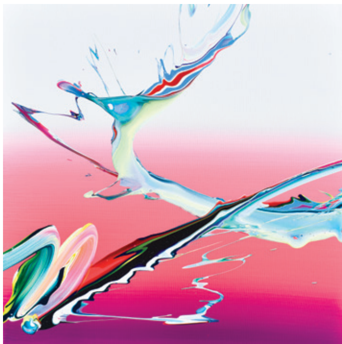
Alex Voinea av_677 , 2020, Acrylic on linen, 60 x 60 cm.