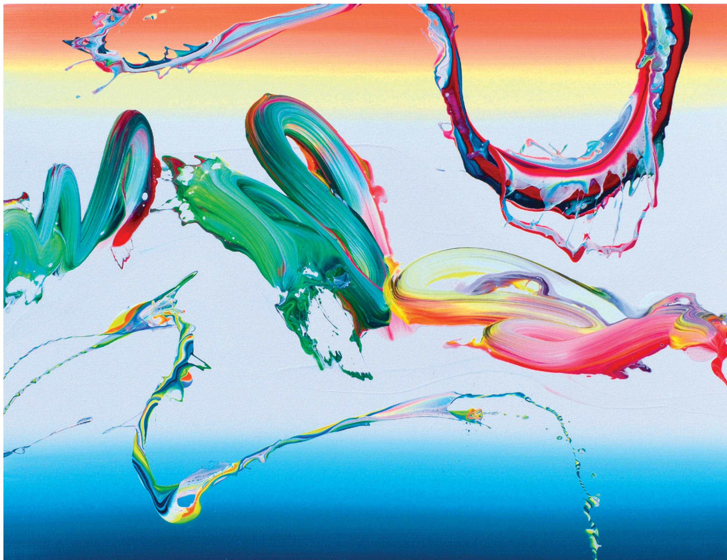
Alex Voinea av_617 Acrylic on linen 114 x 146 cm. 2019