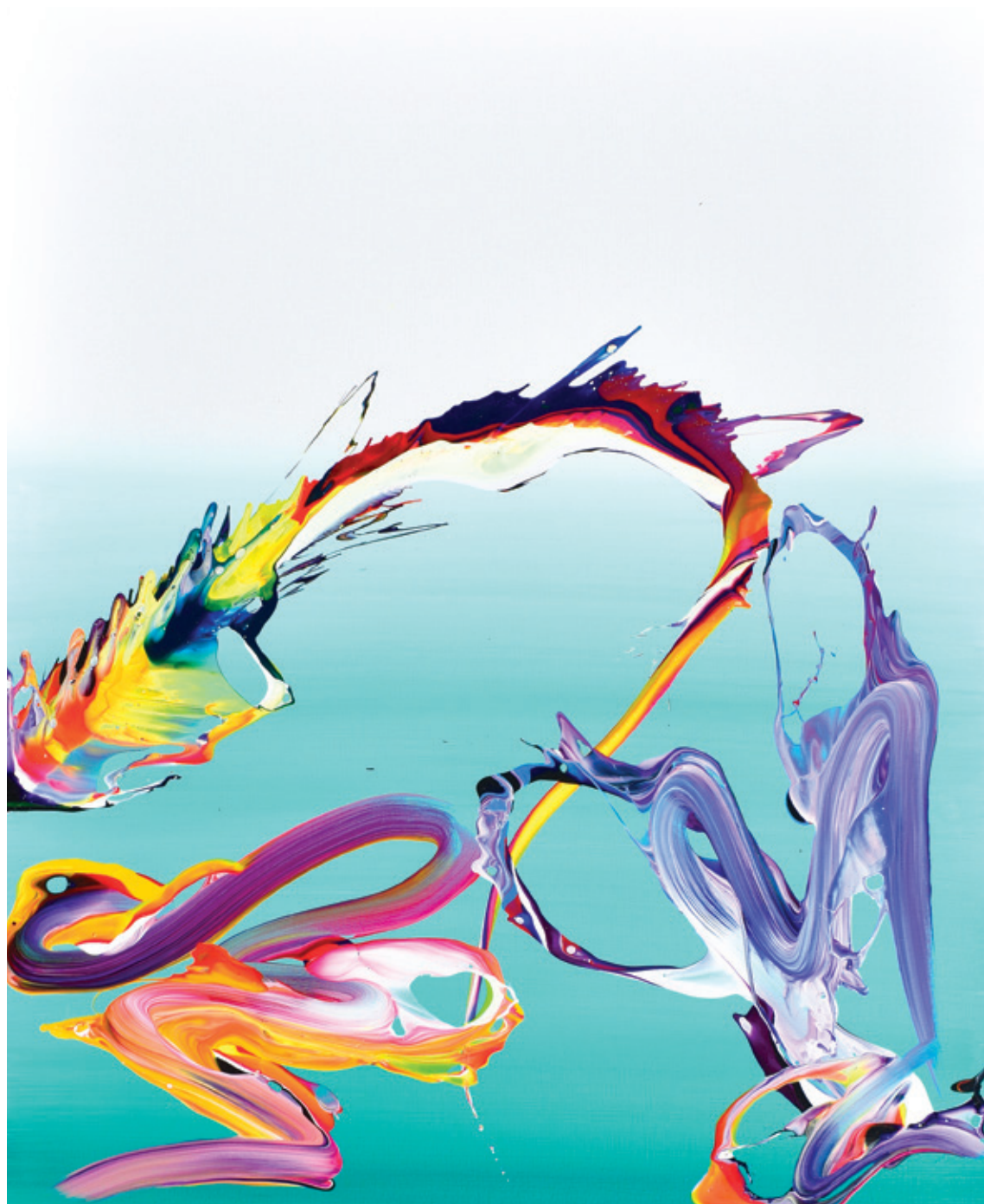
Alex Voinea av_673 , 2020, Acrylic on linen, 159 x 130 cm.