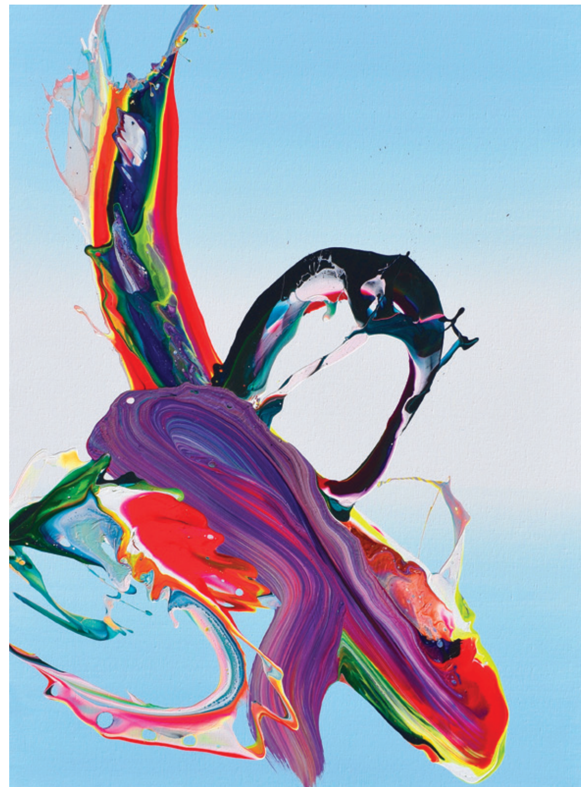
Alex Voinea av_603 , 2019, Acrylic on linen, 130 x 97 cm.