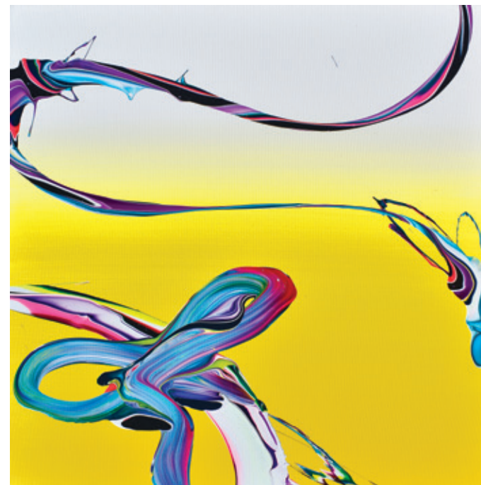
Alex Voinea av_675 , 2020, Acrylic on linen, 60 x 60 cm.