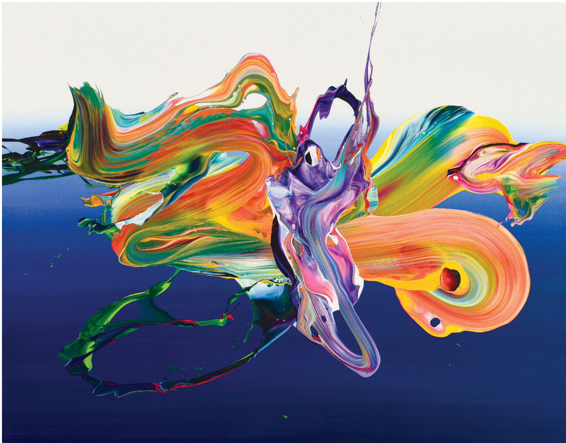
Alex Voinea av_667 Acrylic on linen 114 x 146 cm. 2020