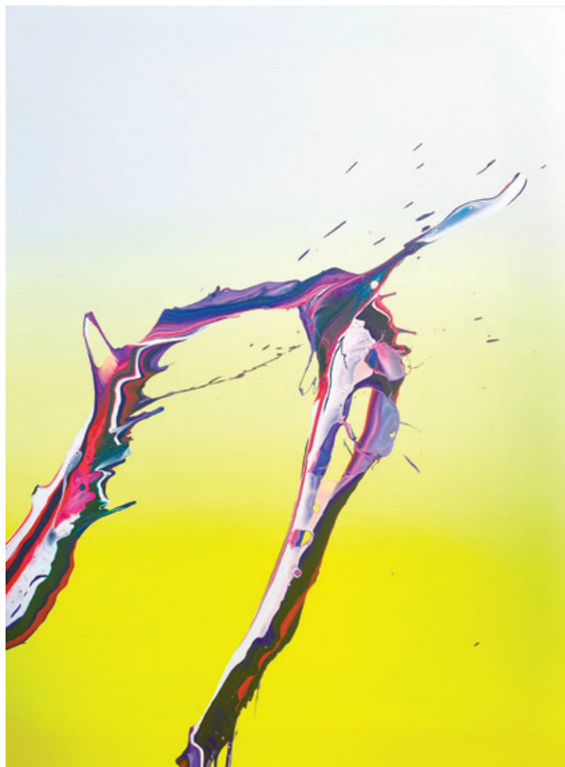
Alex Voinea av_652 , 2020, Acrylic on linen, 73 x 54 cm.