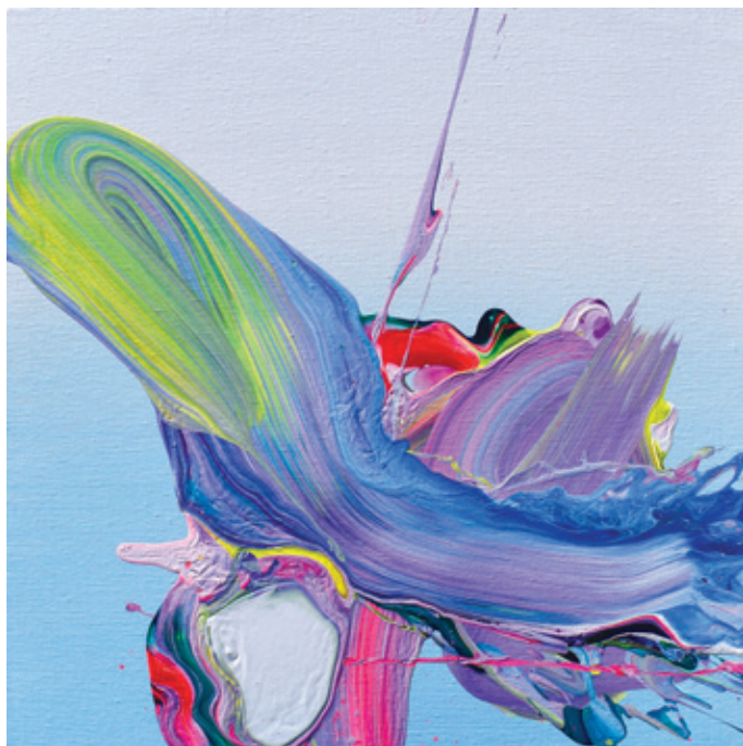
Alex Voinea av_607 , 2019, Acrylic on linen, 60 x 60 cm.