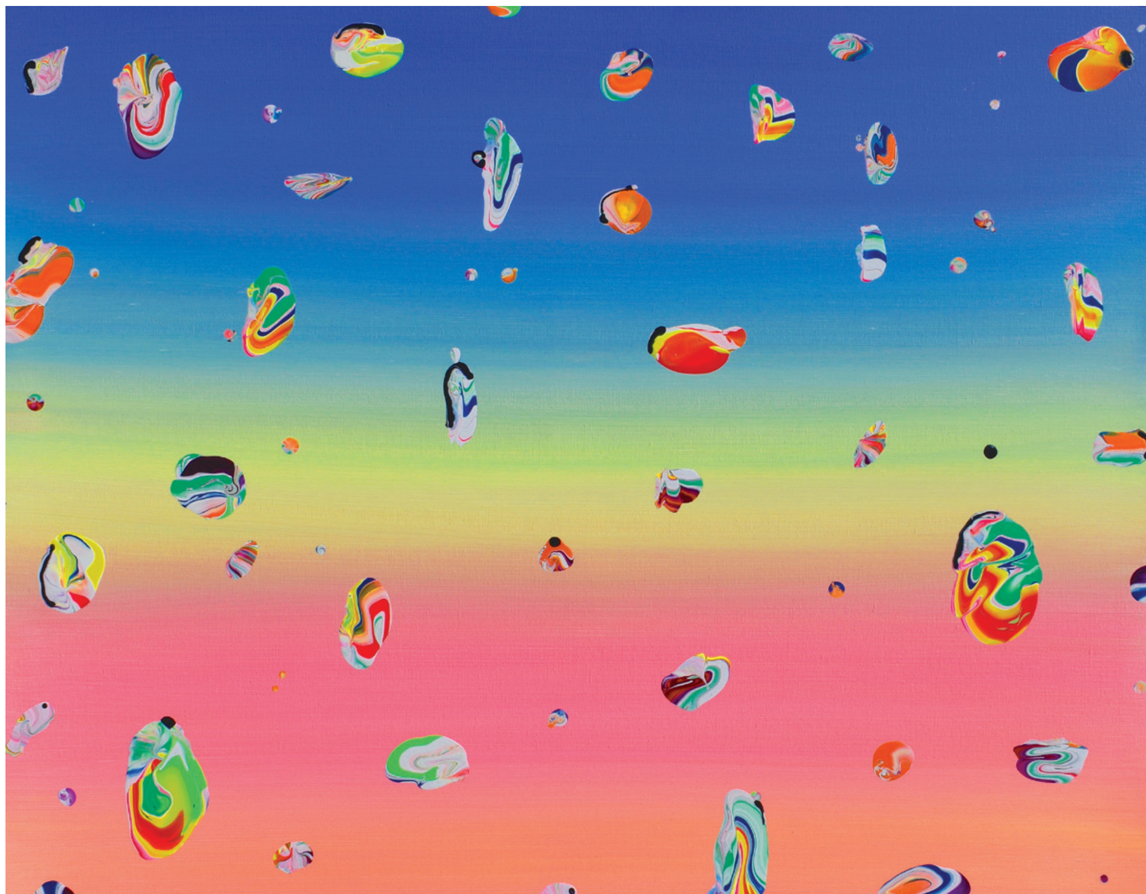
Alex Voinea av_634 Acrylic on linen 114 x 146 cm. 2019