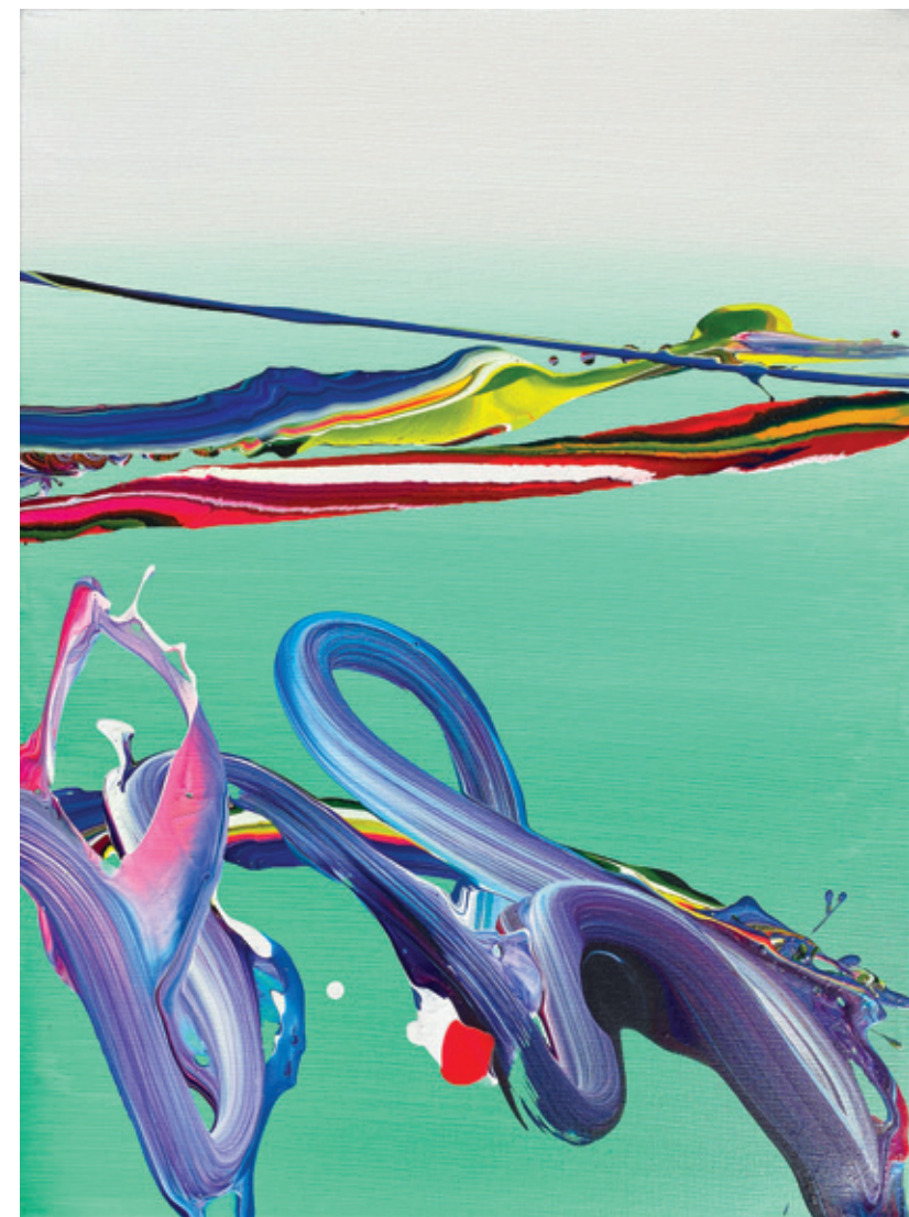
Alex Voinea av_669 , 2020, Acrylic on linen, 73 x 54 cm.