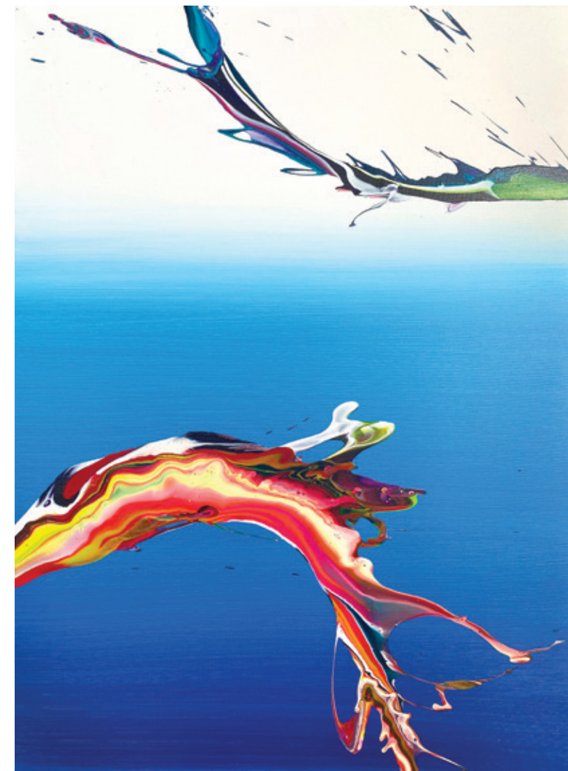
Alex Voinea av_651 , 2020, Acrylic on linen, 73 x 54 cm.