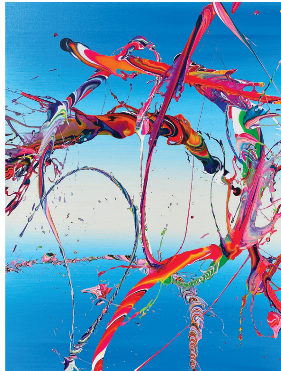
Alex Voinea av_640 , 2020, Acrylic on linen, 116 x 89 cm.