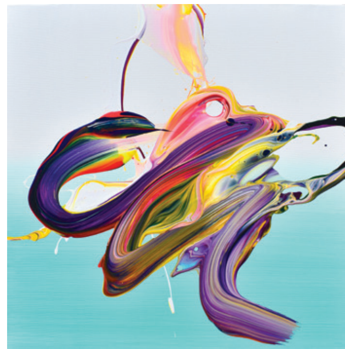
Alex Voinea av_676 , 2020, Acrylic on linen, 60 x 60 cm.