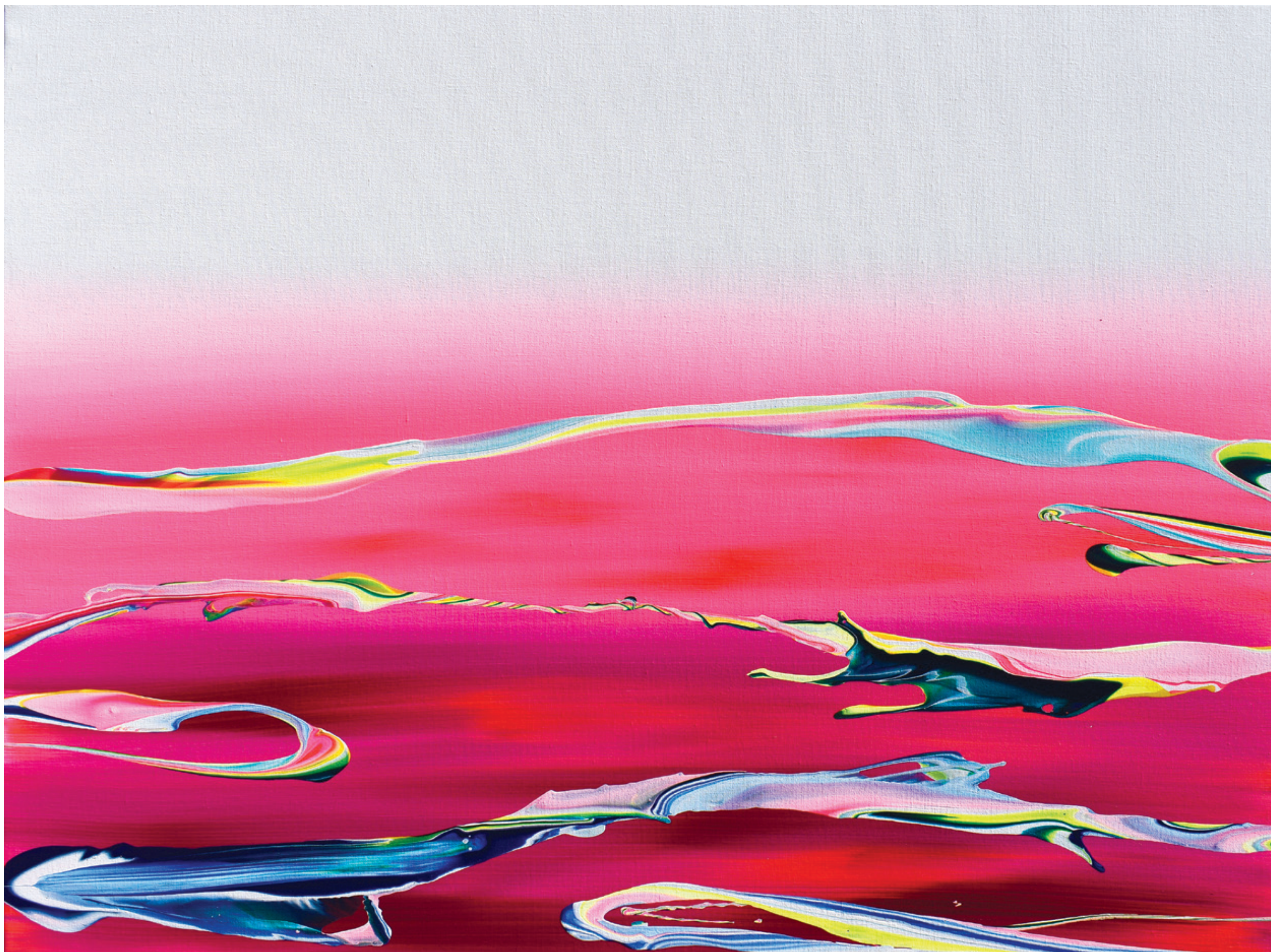
Alex Voinea av_565 Acrylic on linen 97 x 130 cm. 2019 kr 29.000