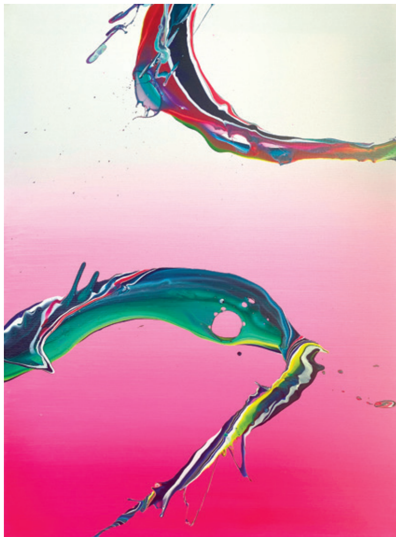
Alex Voinea av_653 , 2020, Acrylic on linen, 73 x 54 cm.