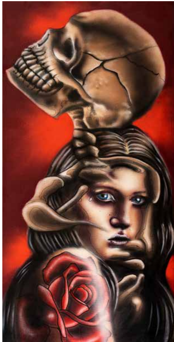
Burnon aka Claus Frederiksen Untitled 10 , 2021, Spray on canvas, 49 x 100 cm. kr. 17.000