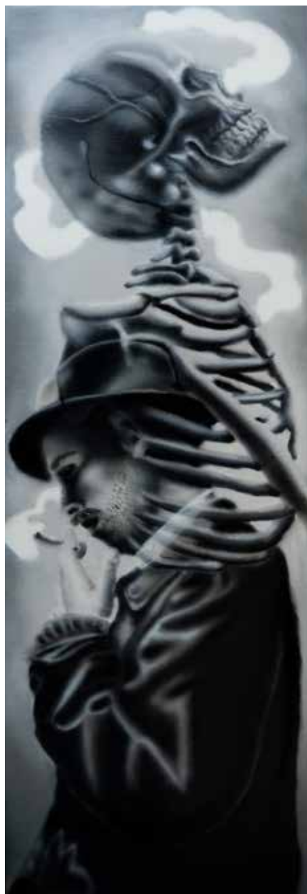
Burnon aka Claus Frederiksen Untitled 4 , 2020, Spray on canvas, 150 x 50 cm. kr 23.000