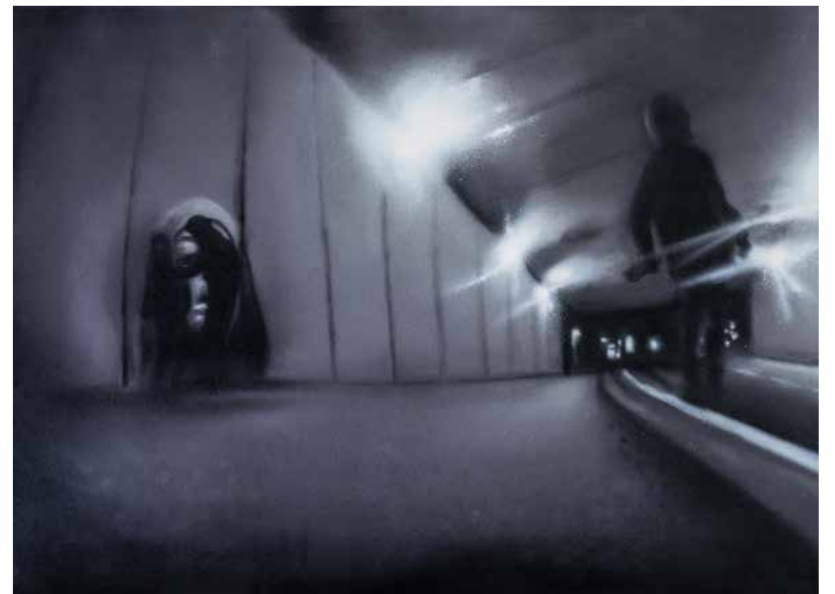
Burnon aka Claus Frederiksen Night Writer , 2019, Spray on canvas, 80 x 113 cm.