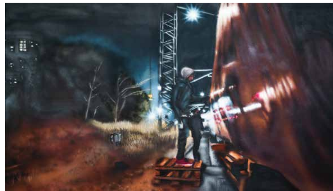
Burnon aka Claus Frederiksen Night Writer 2 , 2018, Spray on canvas, 90 x 110 cm.