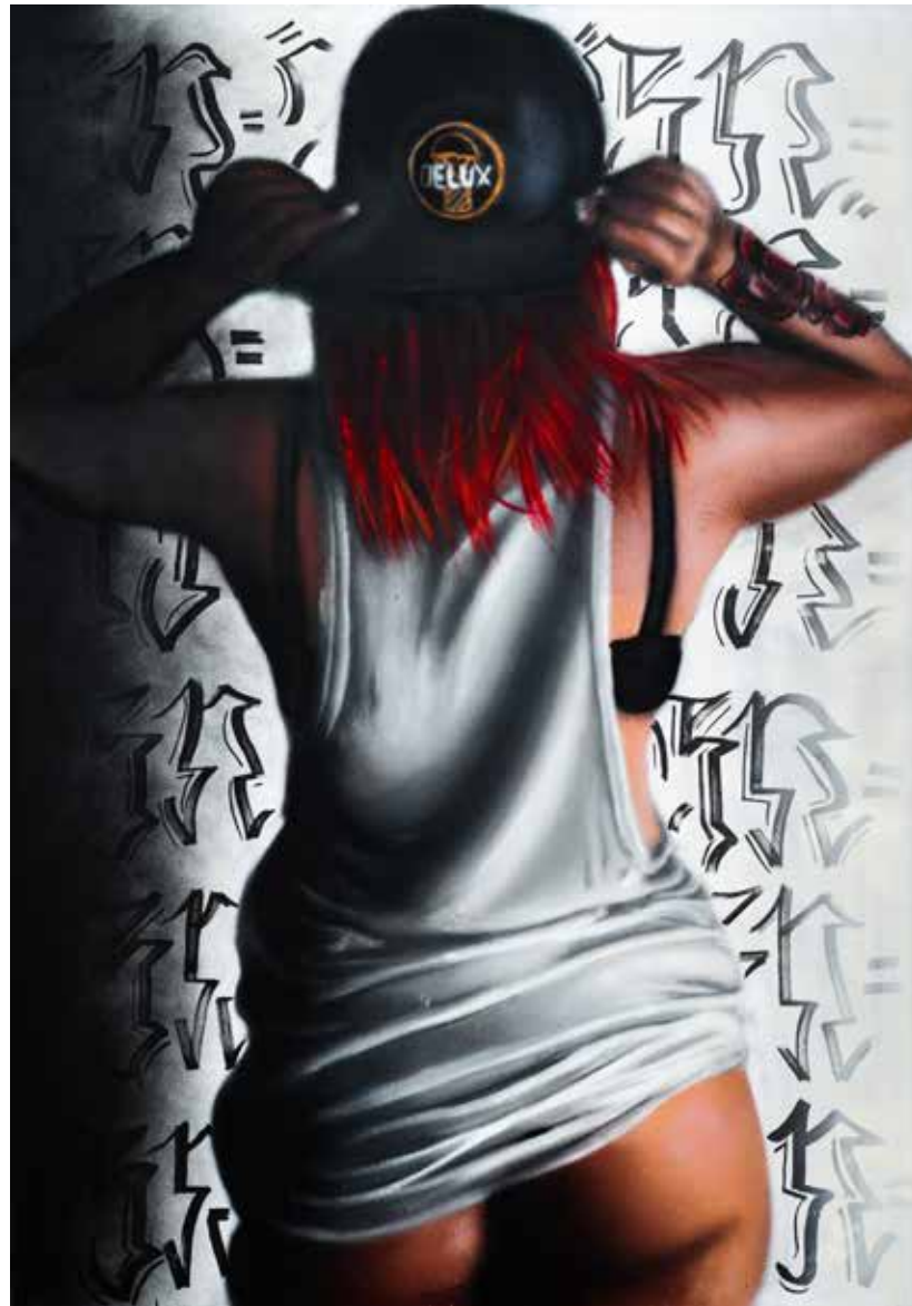
Burnon aka Claus Frederiksen Untitled 16 , 2014, Spray on canvas, 150 x 100 cm. kr 29.500