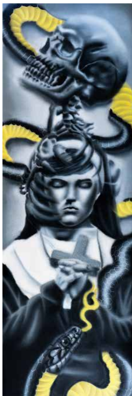
Burnon aka Claus Frederiksen Pray For Us , 2020, Spray on canvas, 50 x 15 cm.