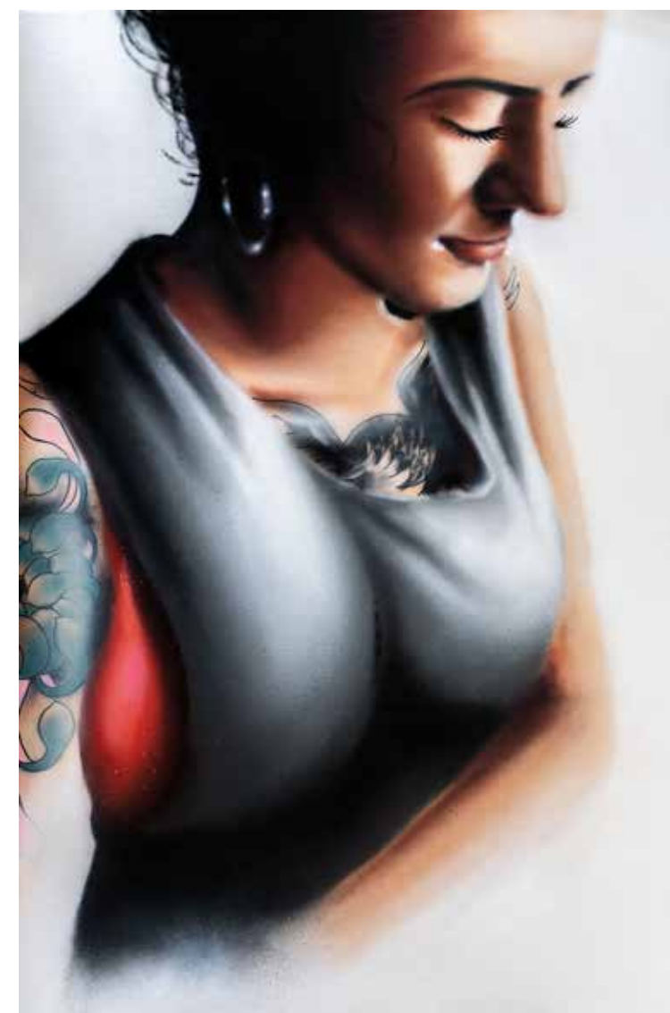
Burnon aka Claus Frederiksen Untitled 5 , 2018, Spray on canvas, 90 x 60 cm.