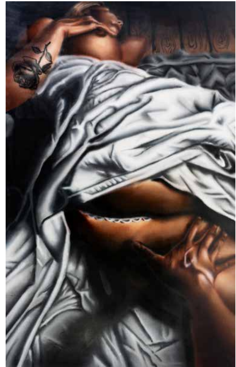
Burnon aka Claus Frederiksen Untitled 9 , 2018, Spray on canvas, 160 x 100 cm. kr 29.500