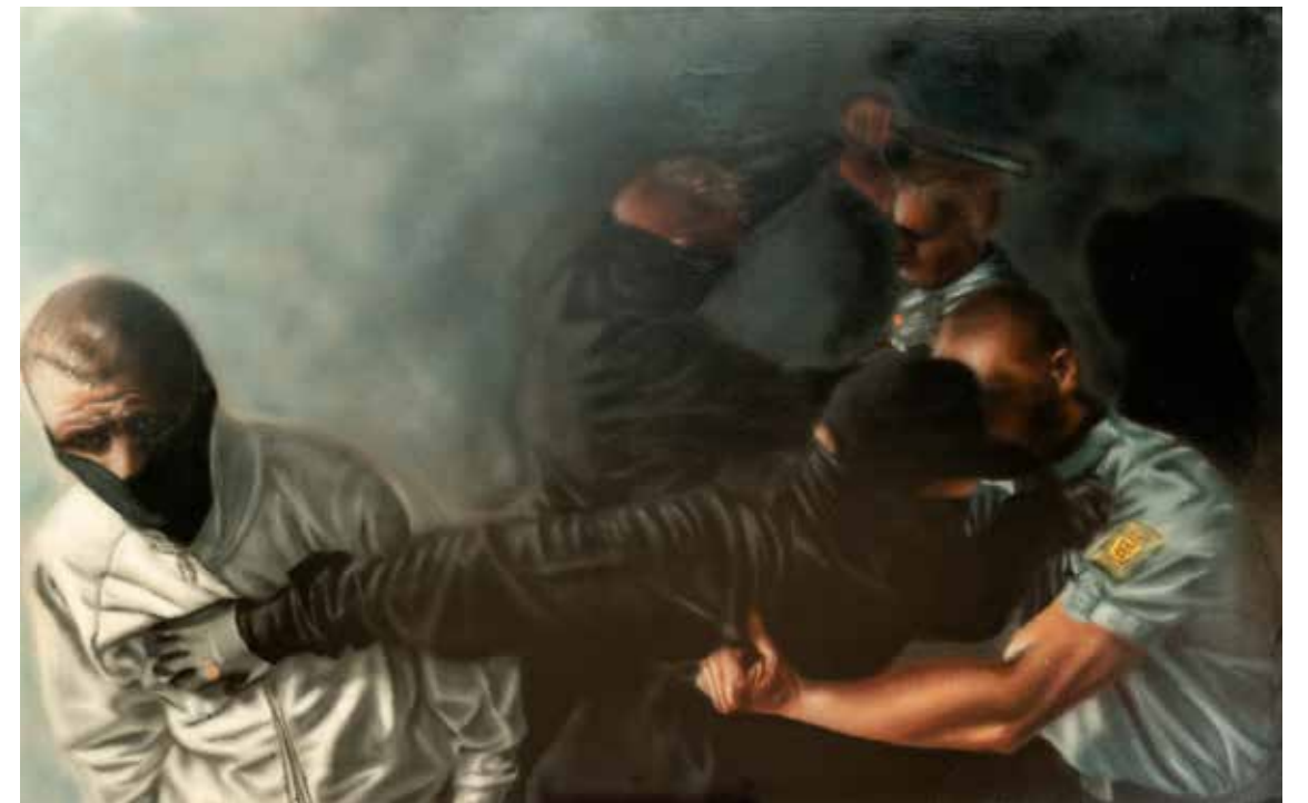
Burnon aka Claus Frederiksen Oprøret kommer 2 , 2014, Spray on canvas, 75 x 100 cm. kr. 32.000