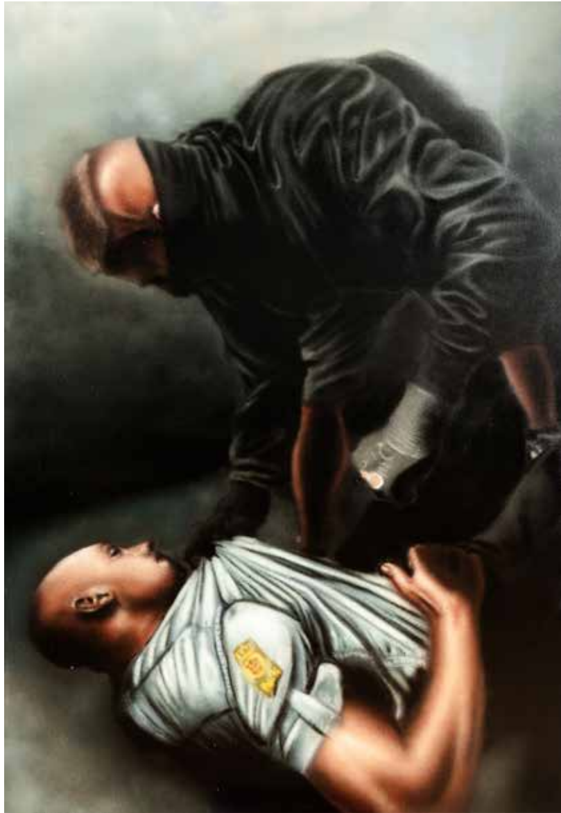
Burnon aka Claus Frederiksen Oprøret kommer 1 , 2014, Spray on canvas, 150 x 110 cm. kr. 35.000