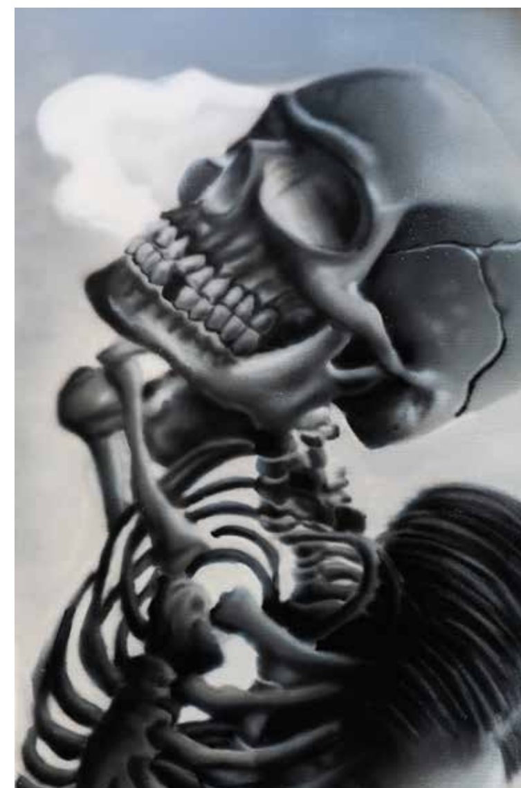
Burnon aka Claus Frederiksen Untitled 3 , 2020, Spray on canvas, 160 x 65 cm. kr 26.000