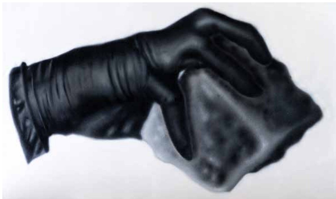
Burnon aka Claus Frederiksen Husker du Benjamin , 2020, Spray on canvas, 65 x 110 cm.