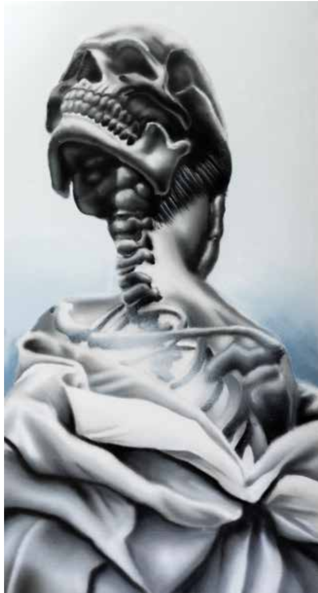
Burnon aka Claus Frederiksen The Devil Is In The Details , 2020, Spray on canvas, 120 x 65 cm. kr 21.500