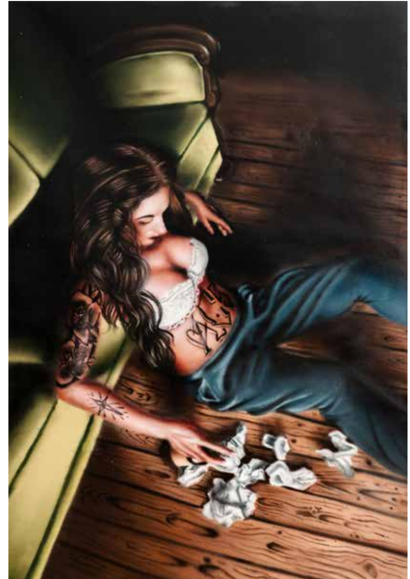
Burnon aka Claus Frederiksen Lost Love , 2016, Spray on canvas, 180 x 110 cm. kr 33.500