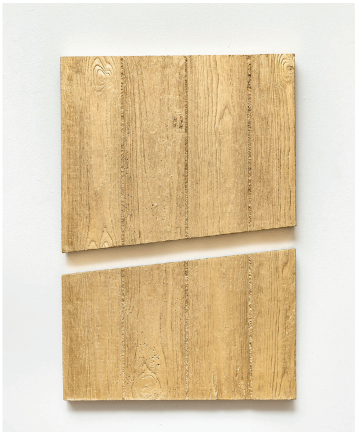
Heiko Zahlmann “Betongold 20 (Gold)”, 2020, Spraypaint on concrete, 65 x 40 x 4 cm.