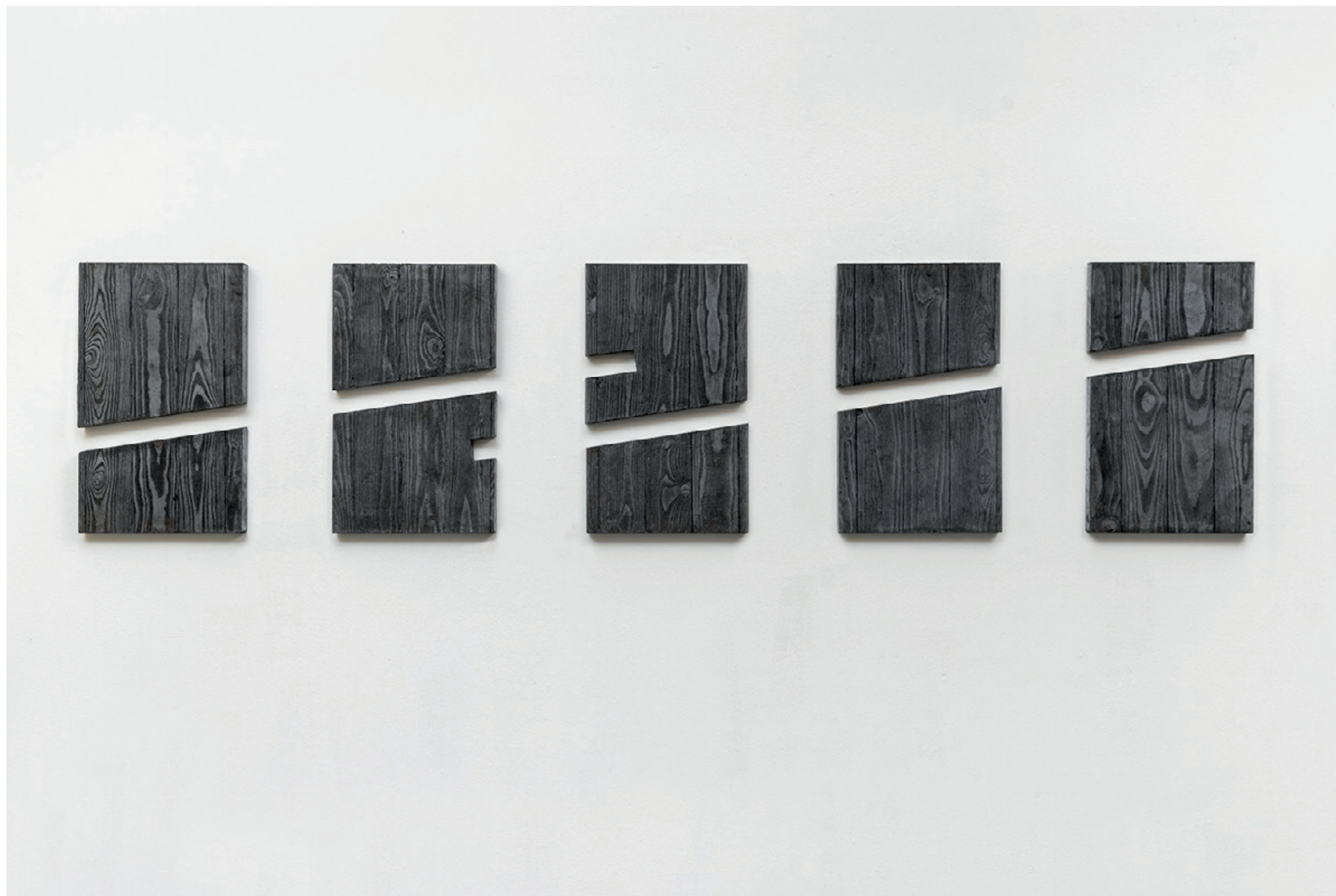
Heiko Zahlmann “You only see the negative aspects 2”, Pigmented concrete, 65 x 265 x 3,5 cm. 2020