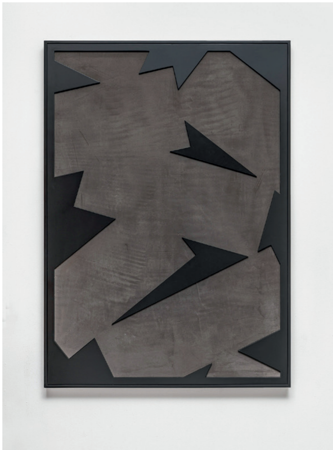
Heiko Zahlmann “Stolen Idea 1” , 2020, Varnish on MDF and concrete, 140 x 100 x 6 cm.