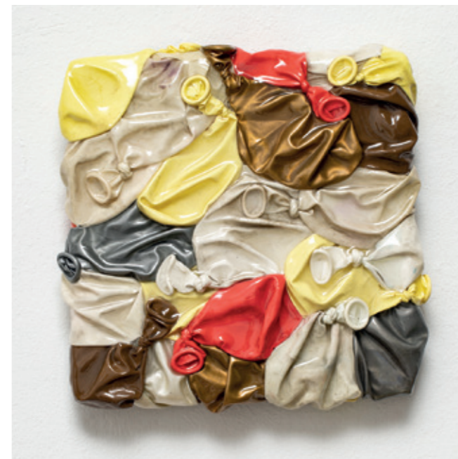
Florian Huber Untitled - From the series "Moments" , 2020, Balloons and epoxy, 20 x 20 x 4 cm.