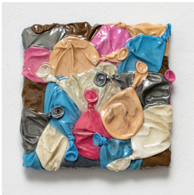
Florian Huber Untitled - From the series “Moments” , 2020, Balloons and epoxy, 20 x 20 x 4 cm. kr 6.800