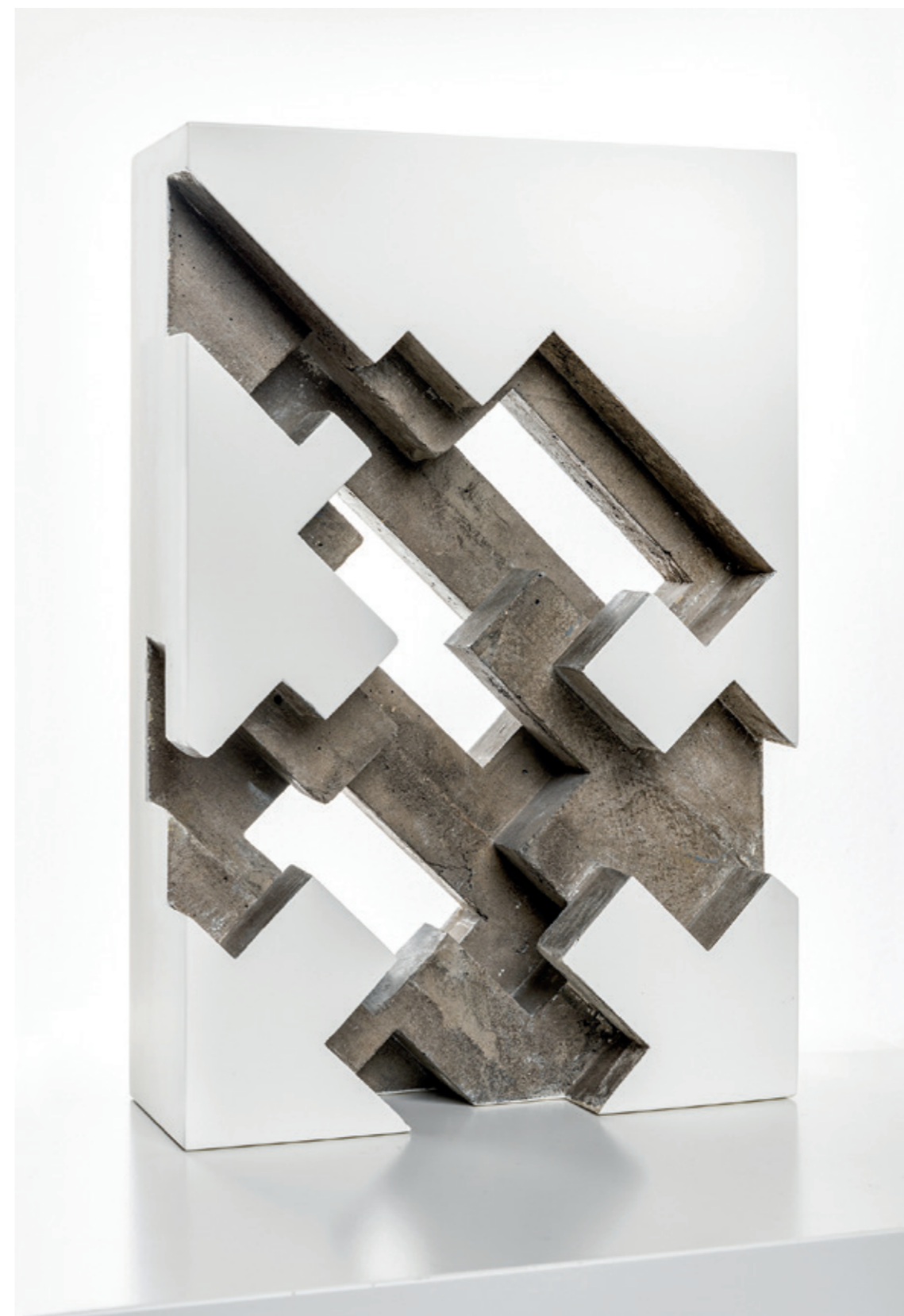
Heiko Zahlmann “Ghost”, 2020, Spraypaint on concrete, 36 x 24 x 9 cm.