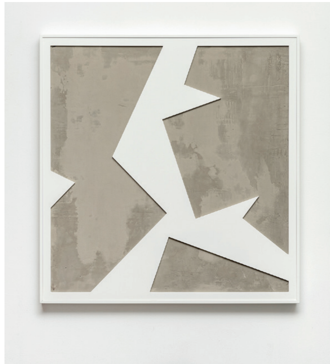
Heiko Zahlmann "Stolen Idea 4", 2020, Varnish on MDF and concrete, 100 x 100 x 6 cm.