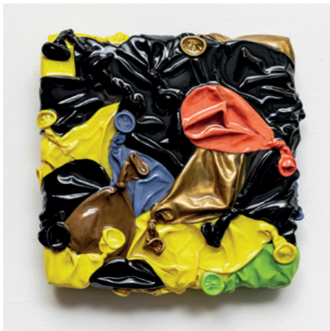
Florian Huber Untitled - From the series "Moments" , 2020, Balloons and epoxy, 20 x 20 x 4 cm.