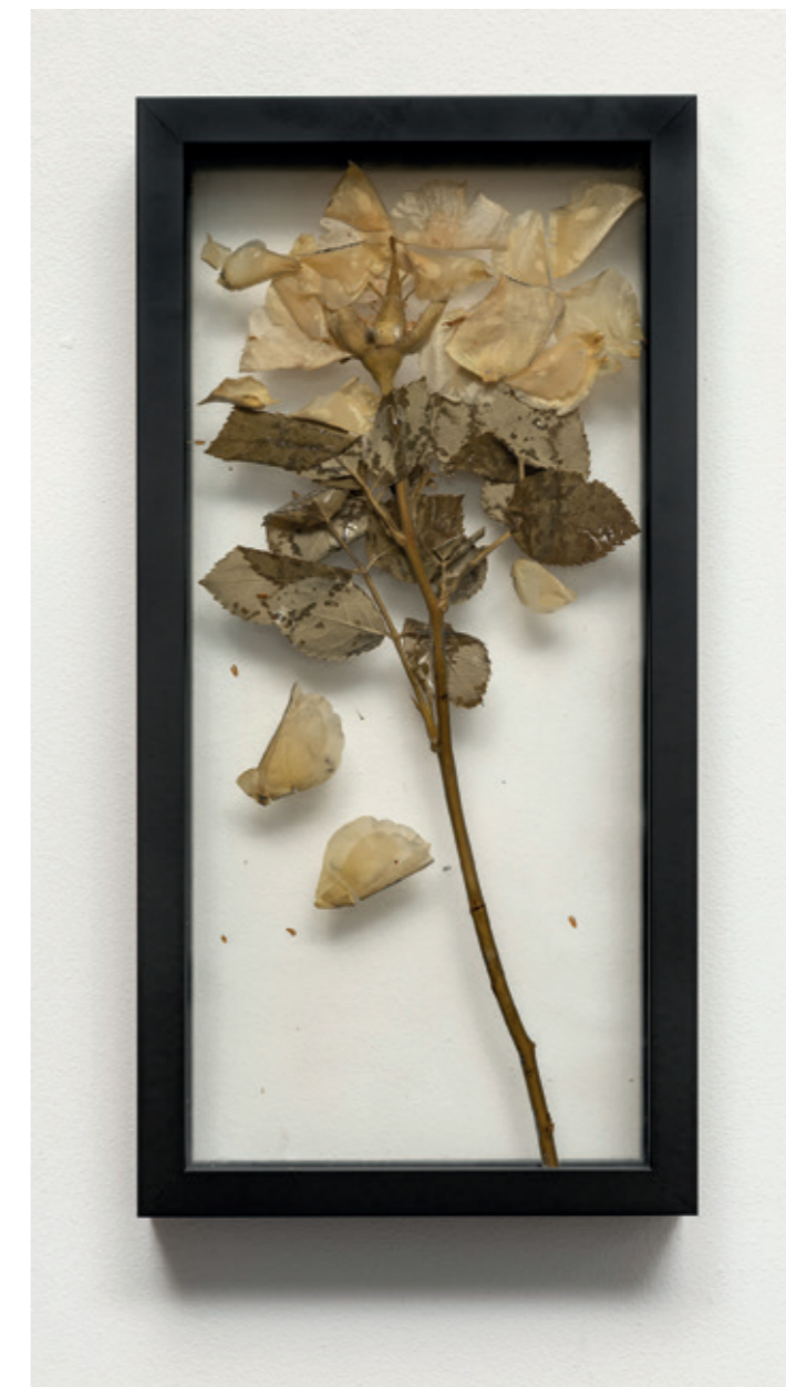
Florian Huber Untitled (Rose) - From the series “You are beautiful”, 2020, Mixed media in epoxy, 36 x 18 x 4,5 cm.