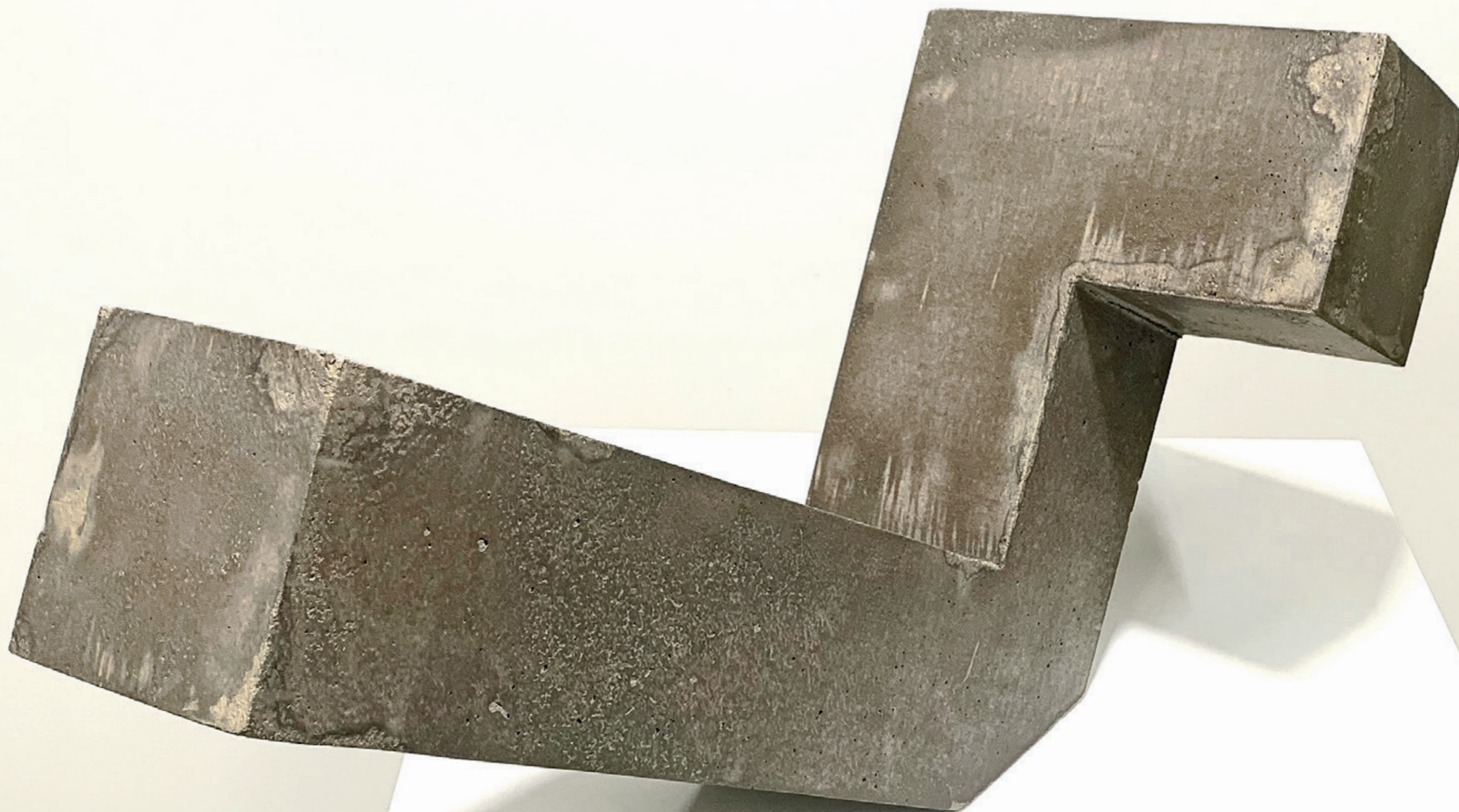
Heiko Zahlmann “Crazy Leg 1 (RAW)” 2020, Varnish on concrete, 30 x 55 x 20 cm.