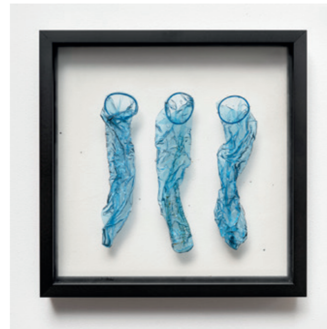
Florian Huber Condoms - From the series "s(ein)", 2020, Mixed media in epoxy, 31, 5 x 31,5 x 4,5 cm.