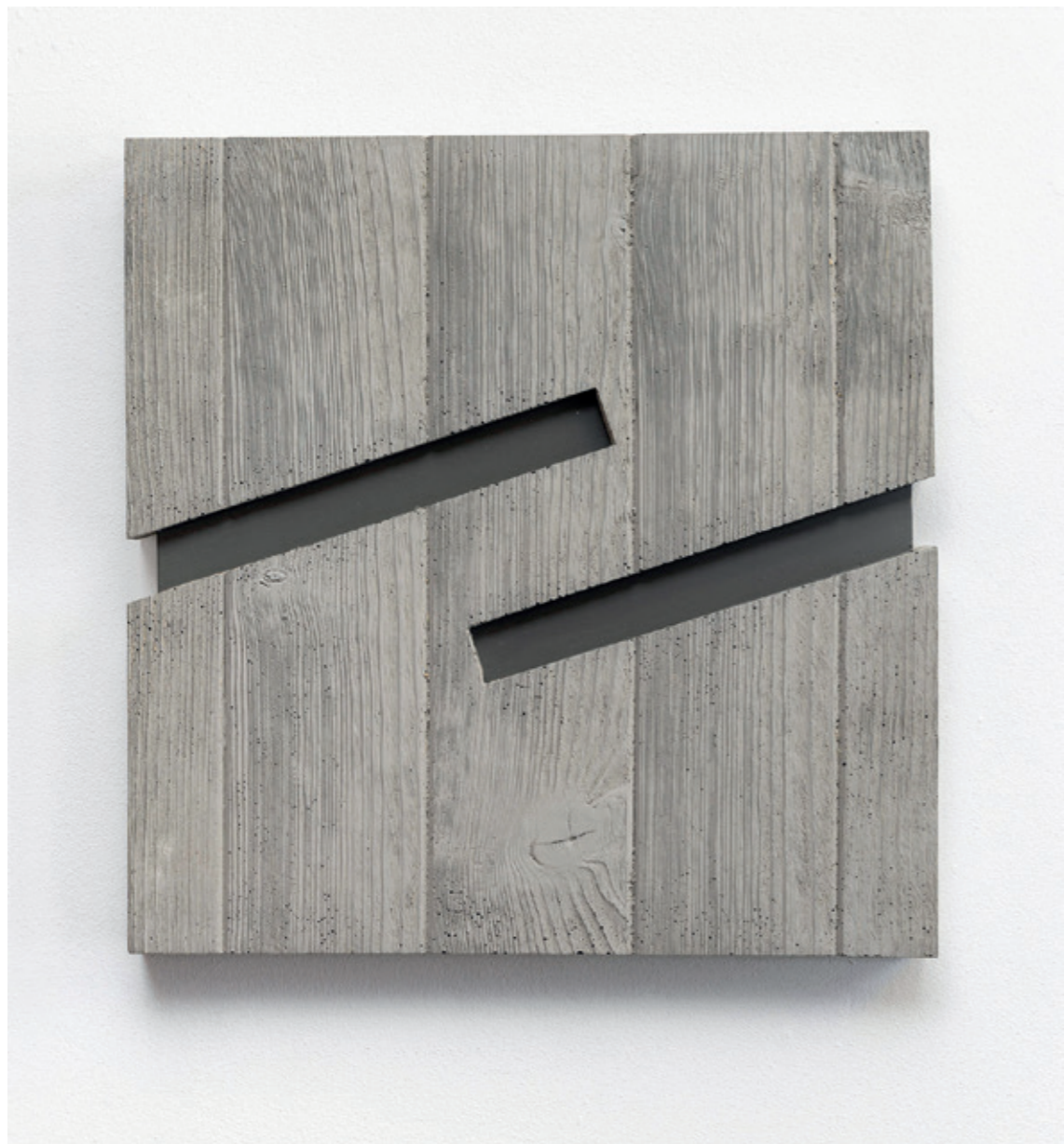
Heiko Zahlmann "Zacharias 1", 2020, Spraypaint on concrete, 40 x 40 cm.