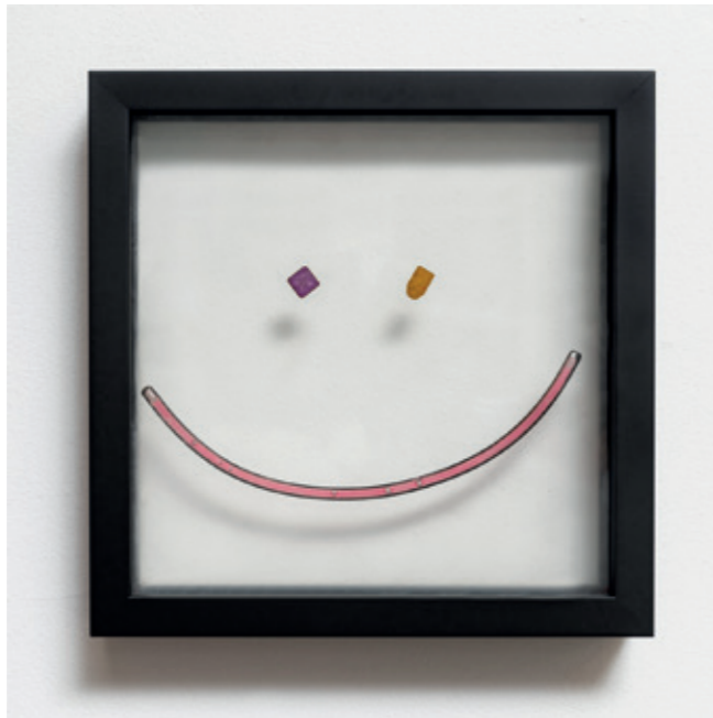
Florian Huber Untitled - (Smiling face) - From the series “You are beautiful”, 2020, Mixed media in epoxy, 21,5 x 21,5 x 4,5 cm.