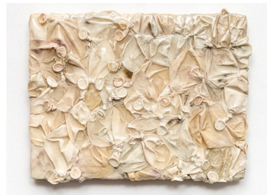
Florian Huber Untitled - From the series “Moments” , 2020, Balloons and epoxy, 31 x 41 x 4 cm. kr 12.000