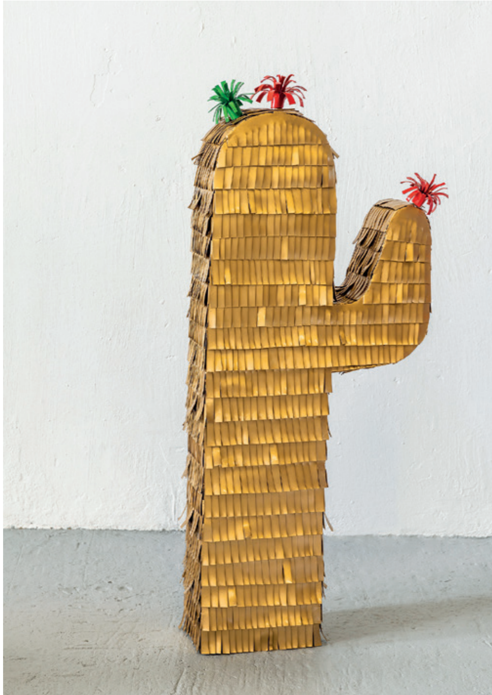
Florian Huber Golden cactus - From the series “dale dale dale”, 2020, Laquer on steel, 105 x 50 x 15 cm.