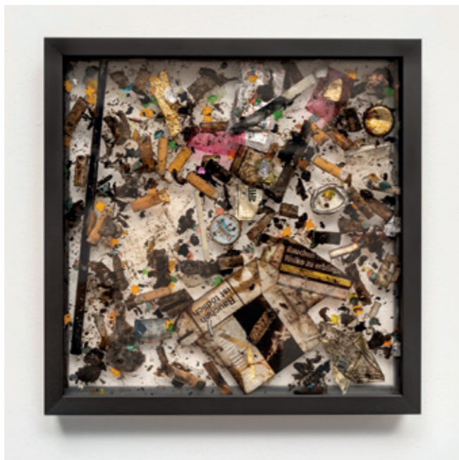
Florian Huber Untitled - From the series "You are beautiful", 2020, Mixed media in epoxy, 31, 5 x 31,5 x 4,5 cm.