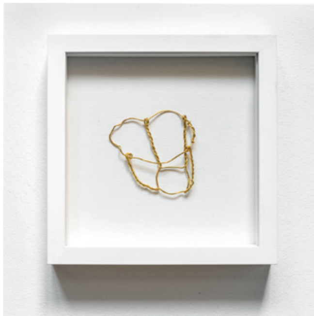
Florian Huber Jeunesse dorée, 2020, Goldwire, 18-carat gold, 7 x 7 x 1,5 cm. Edition: 1 of 10