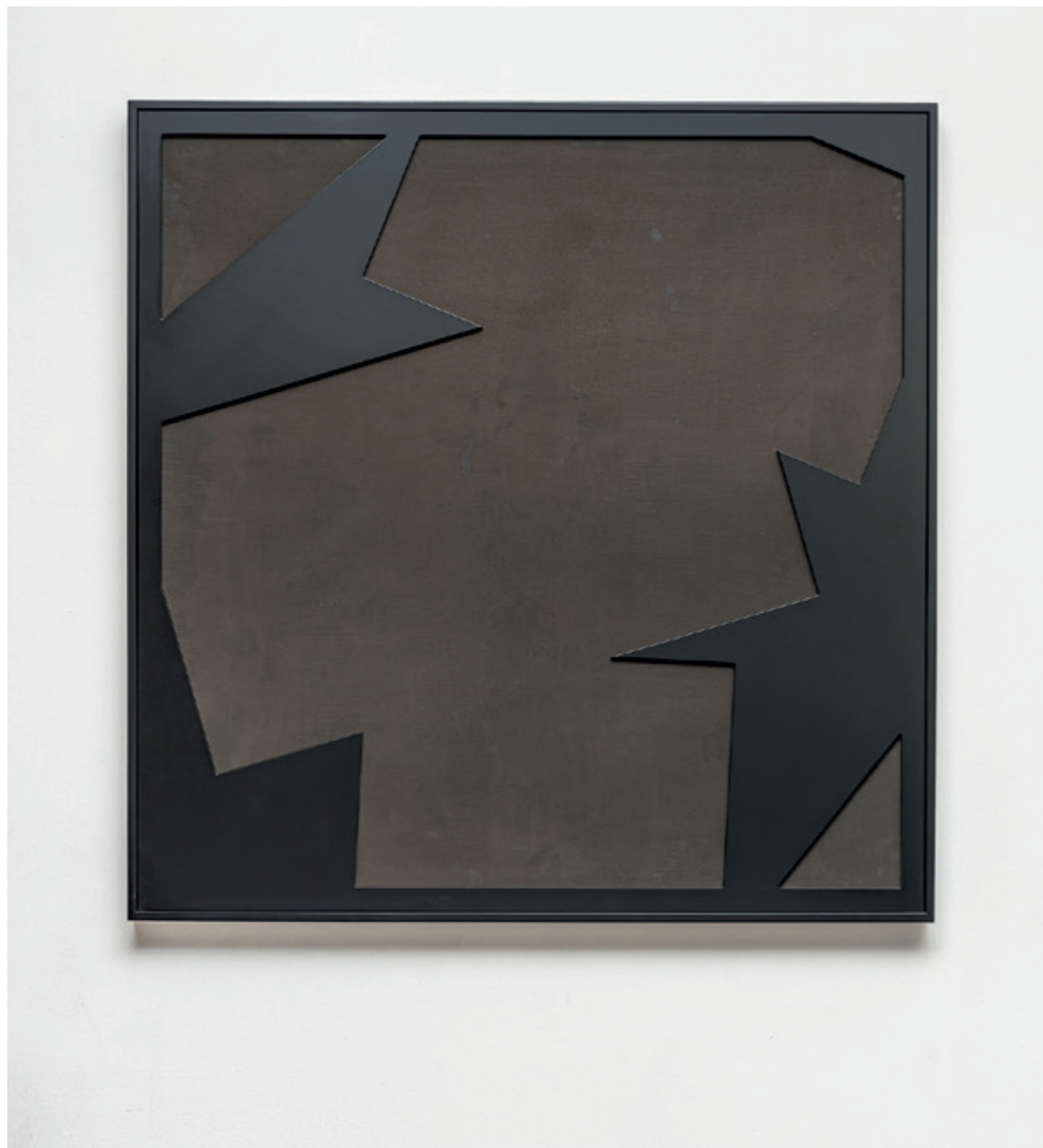
Heiko Zahlmann "Stolen Idea 3", 2020, Varnish on MDF and concrete, 100 x 100 x 6 cm.