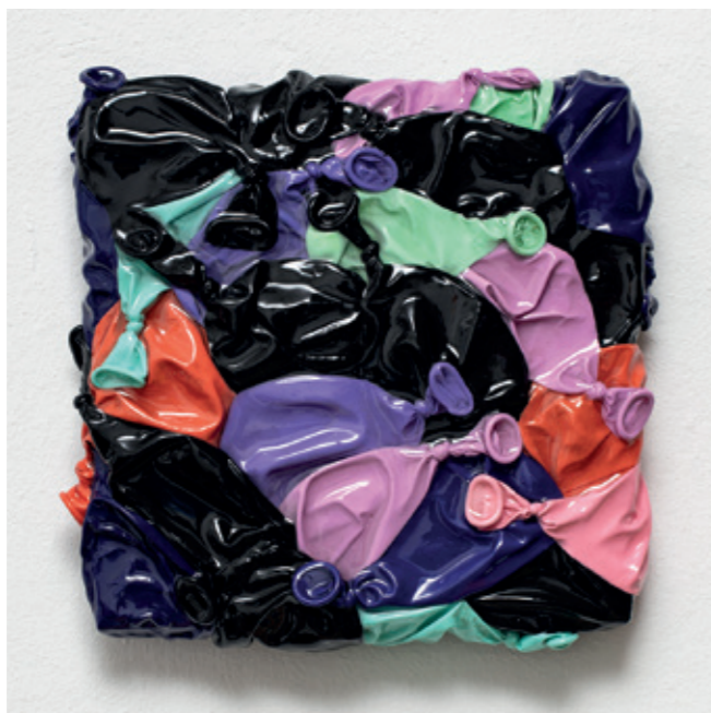
Florian Huber Untitled - From the series "Moments" , 2020, Balloons and epoxy, 20 x 20 x 4 cm.