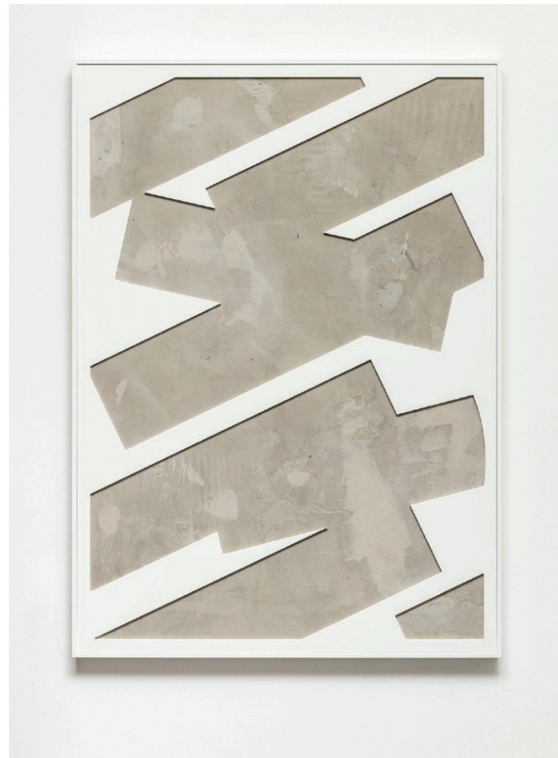
Heiko Zahlmann “Stolen Idea 2” , 2020, Varnish on MDF and concrete, 140 x 100 x 6 cm.