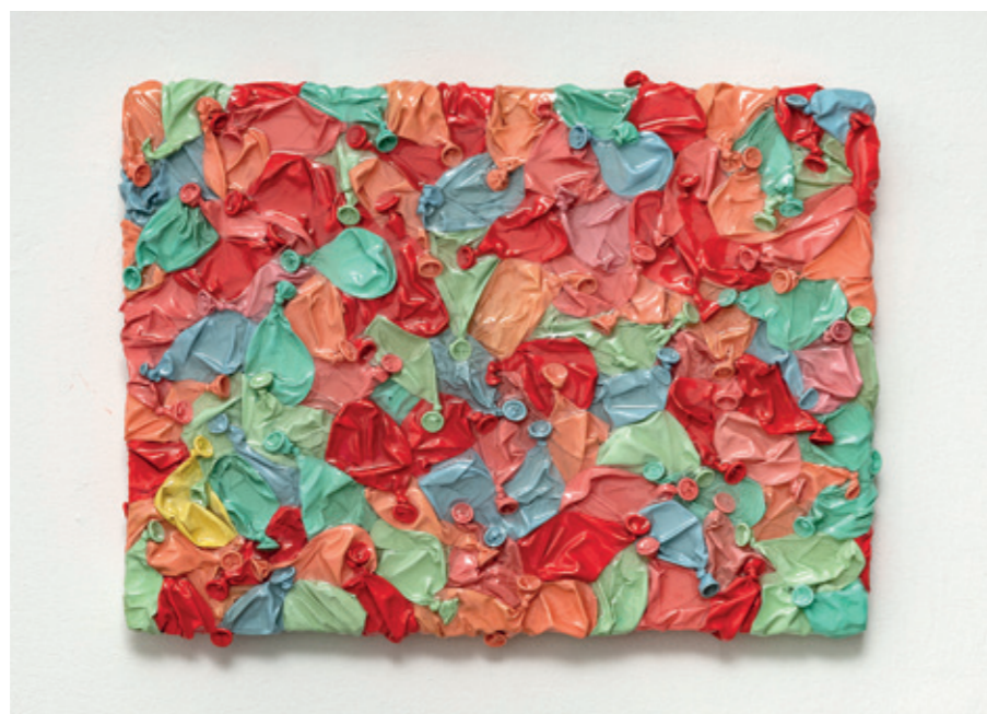
Florian Huber Untitled - From the series “Moments” , 2019, Balloons and epoxy, 40 x 55 x 6 cm. kr 16.500