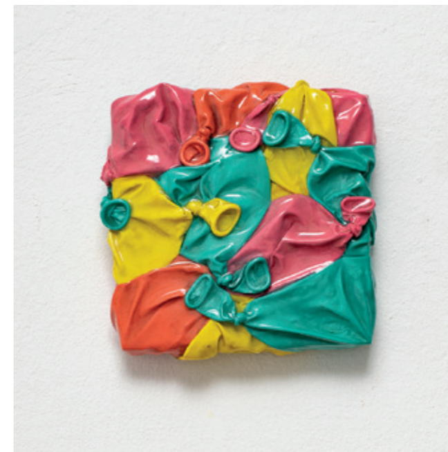
Florian Huber Untitled - From the series “Moments” , 2020, Balloons and epoxy, 15 x 15 x 4 cm. kr 5.200