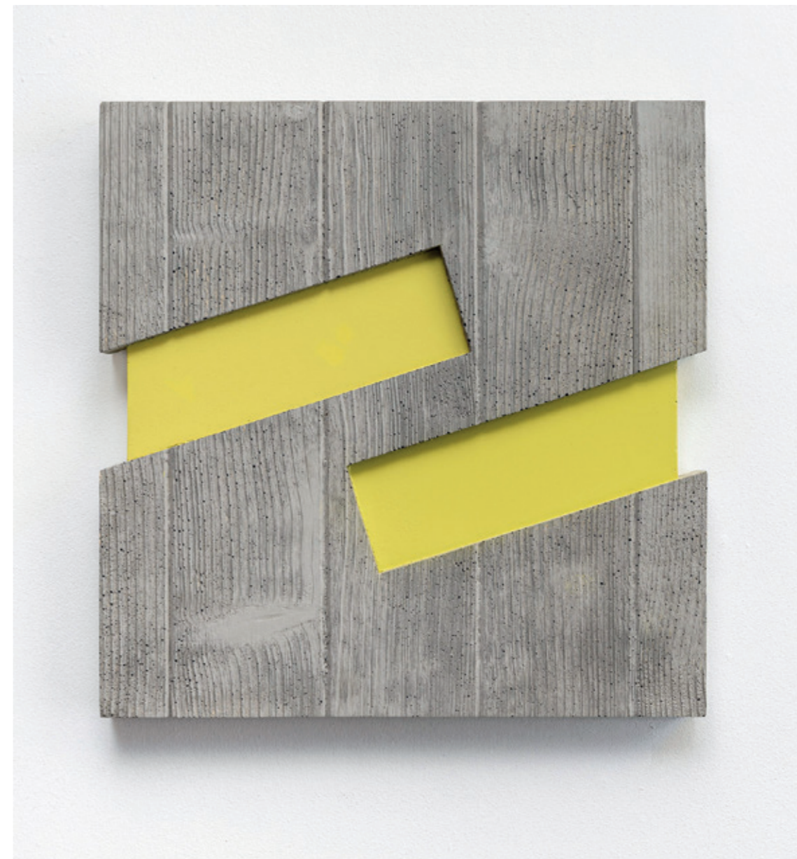
Heiko Zahlmann "Zacharias 2", 2020, Spraypaint on concrete, 40 x 40 cm.