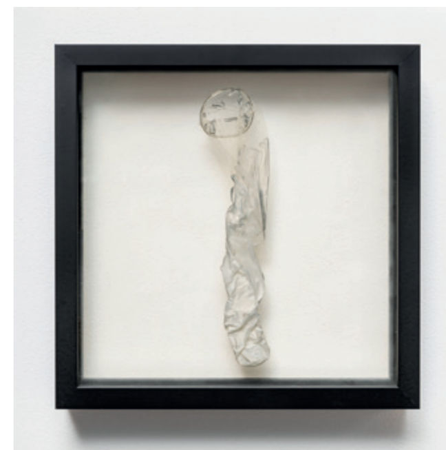
Florian Huber Condom - From the series "s(ein)", 2020, Mixed media in epoxy, 25,5 x 25,5 x 4,5 cm.