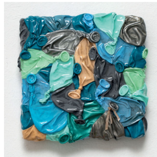
Florian Huber Untitled - From the series "Moments" , 2020, Balloons and epoxy, 20 x 20 x 4 cm.