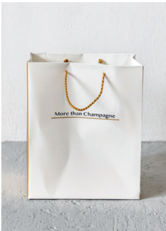
Heiko Zahlmann & Florian Huber “More than Champagne” , 2020, Laquer on steel, 44 x 35,5 x 16 cm. Edition 1 of 10. kr 18.000