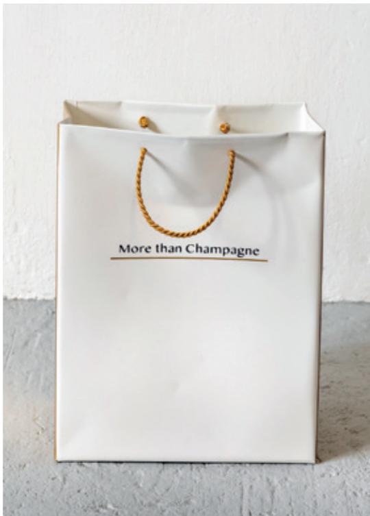
Heiko Zahlmann & Florian Huber “More than Champagne” , 2020, Laquer on steel, 44 x 35,5 x 16 cm. Edition 1 of 10. kr 18.000