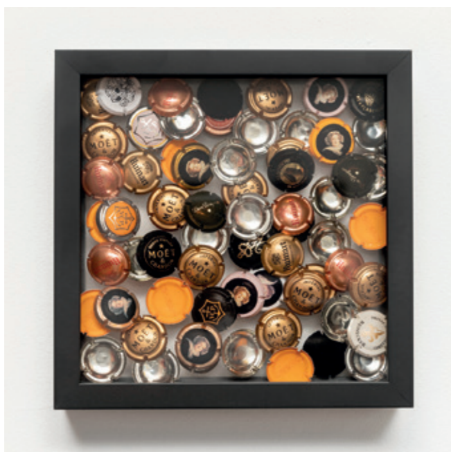
Florian Huber Capsels, 2020, Mixed media in epoxy, 21, 5 x 21,5 x 4,5 cm.