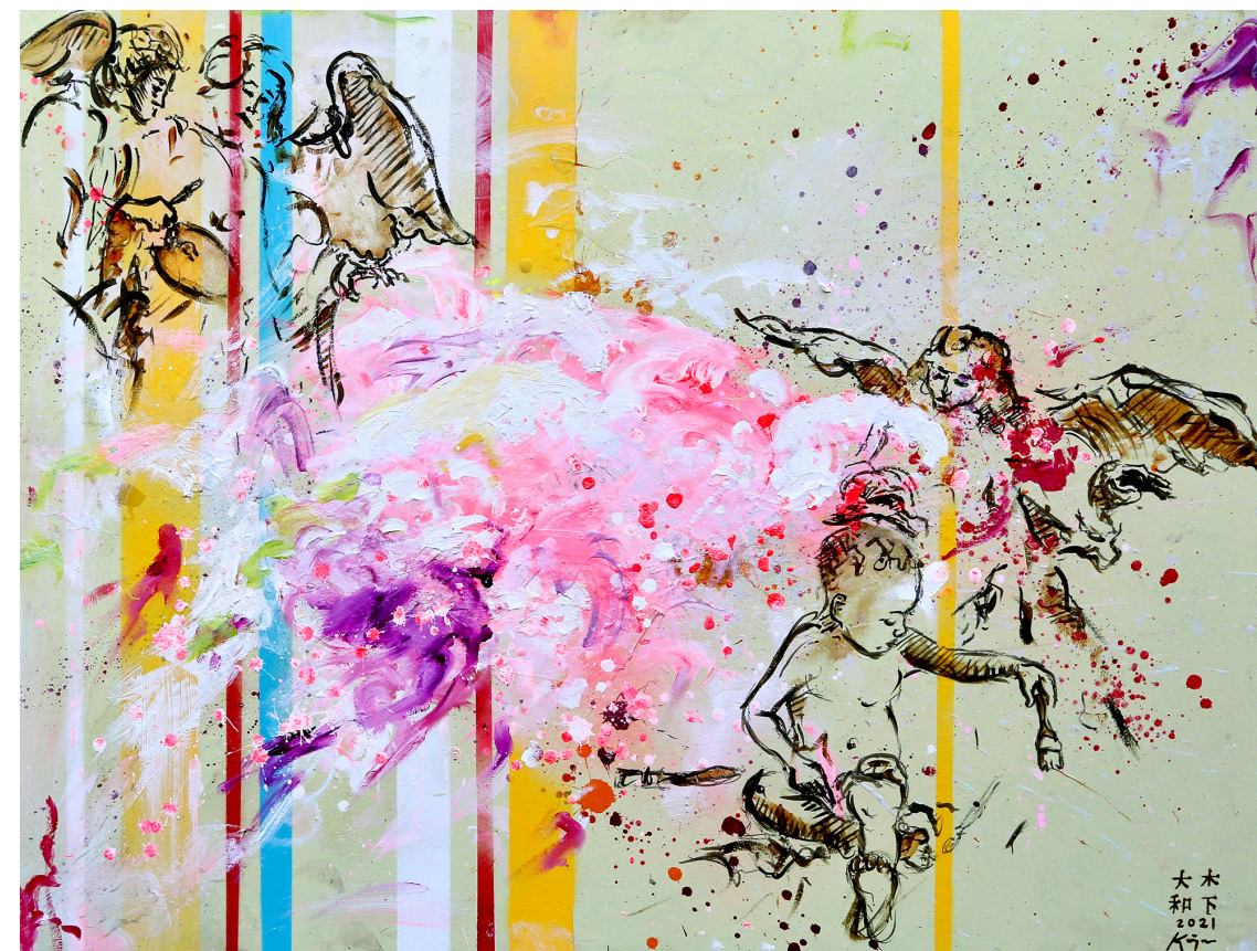
Smike Kászner Art for children part 4 , 2021, Acrylic and oil on wood, 90 x 110 cm.