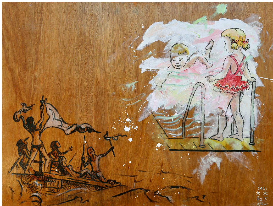
Smike Kászner Art for children part 2 , 2021, Acrylic and oil on wood, 90 x 110 cm.