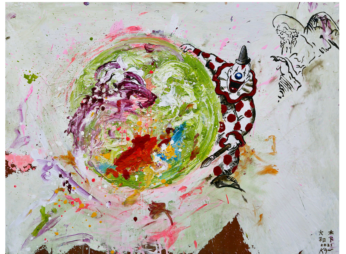
Smike Kászner Art for children part 1 , 2021, Acrylic and oil on wood, 90 x 110 cm.