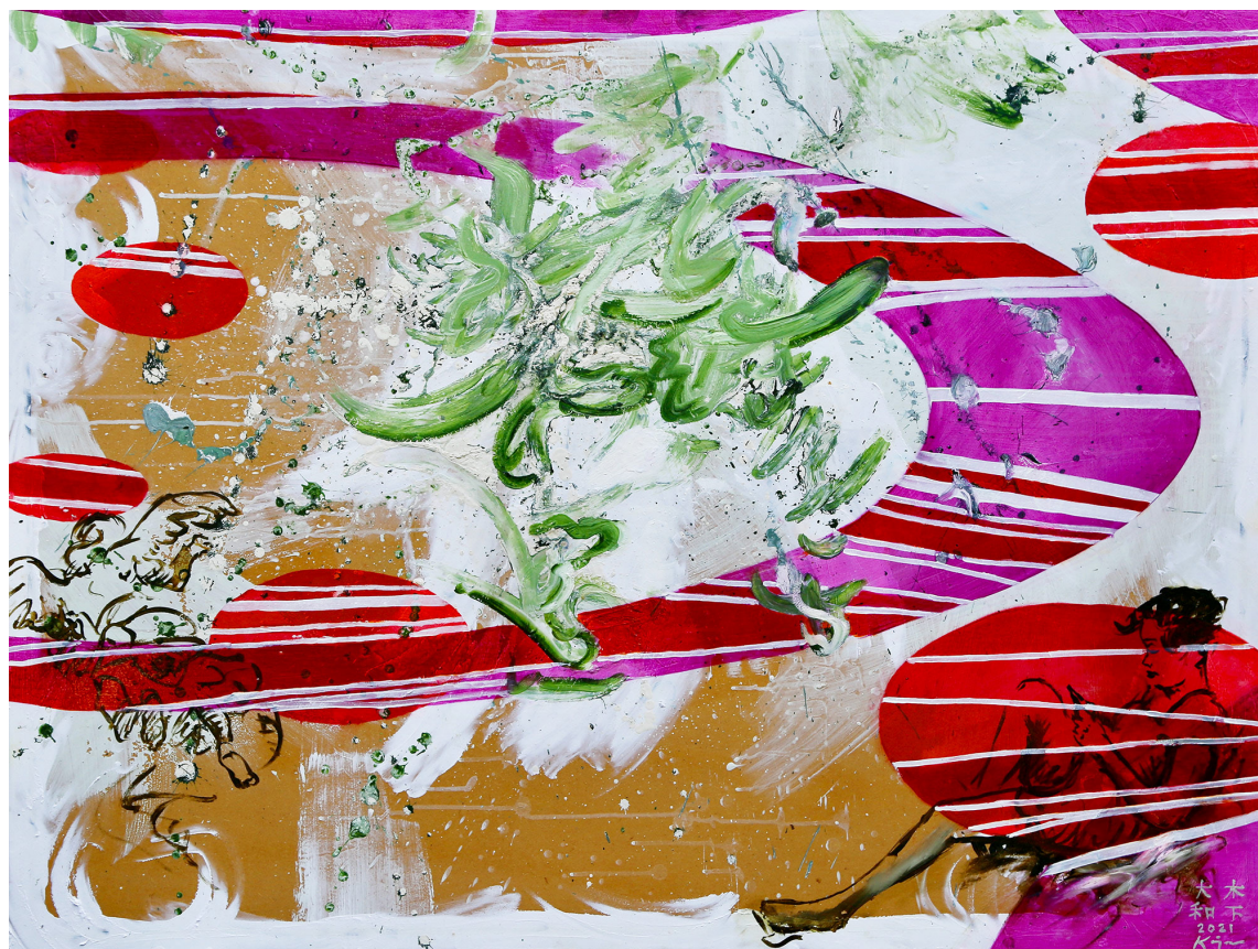
Smike Kászner Art for children part 5 , 2021, Acrylic and oil on wood, 90 x 110 cm.