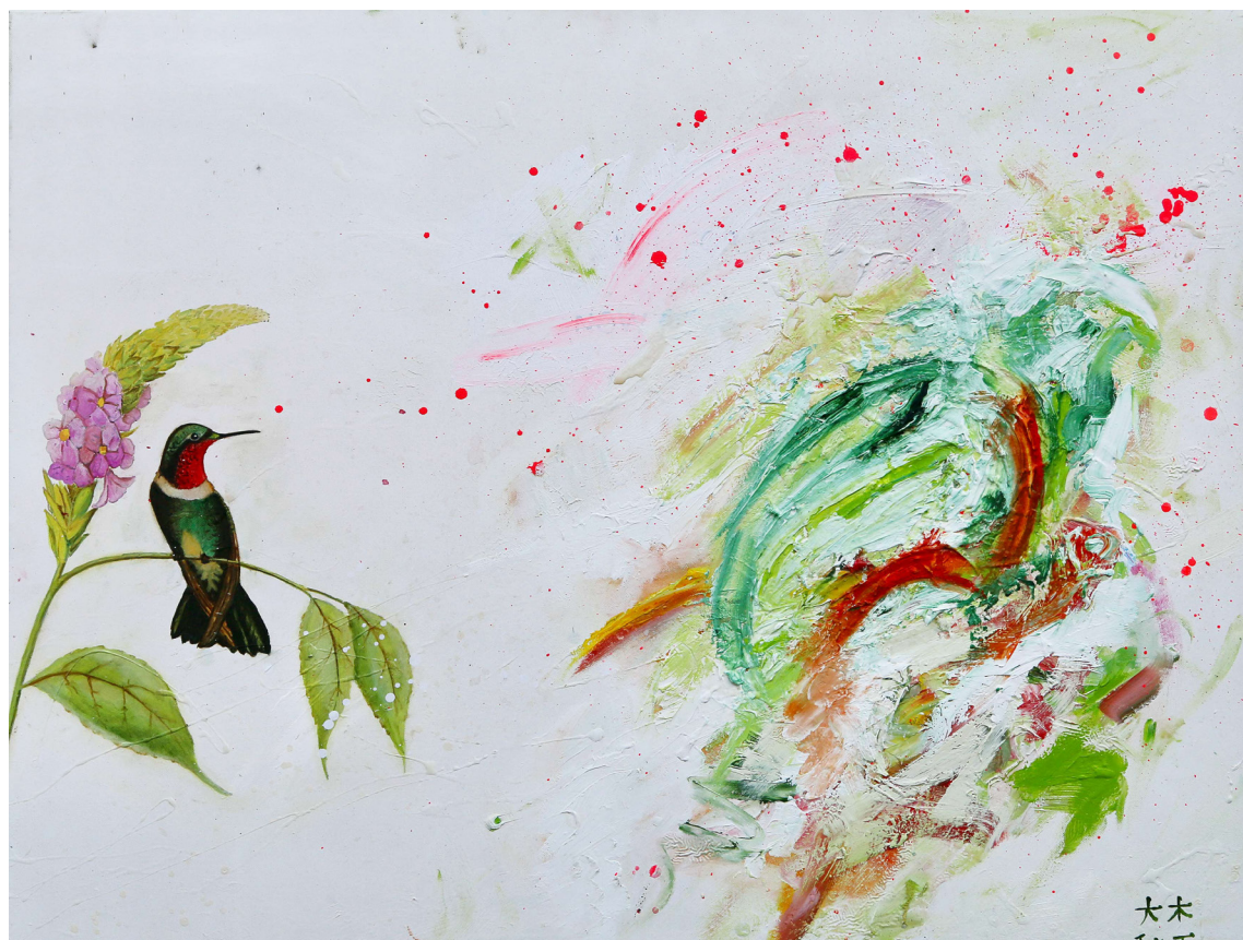
Smike Kászner Art for children part 3 , 2021, Acrylic and oil on wood, 90 x 110 cm.